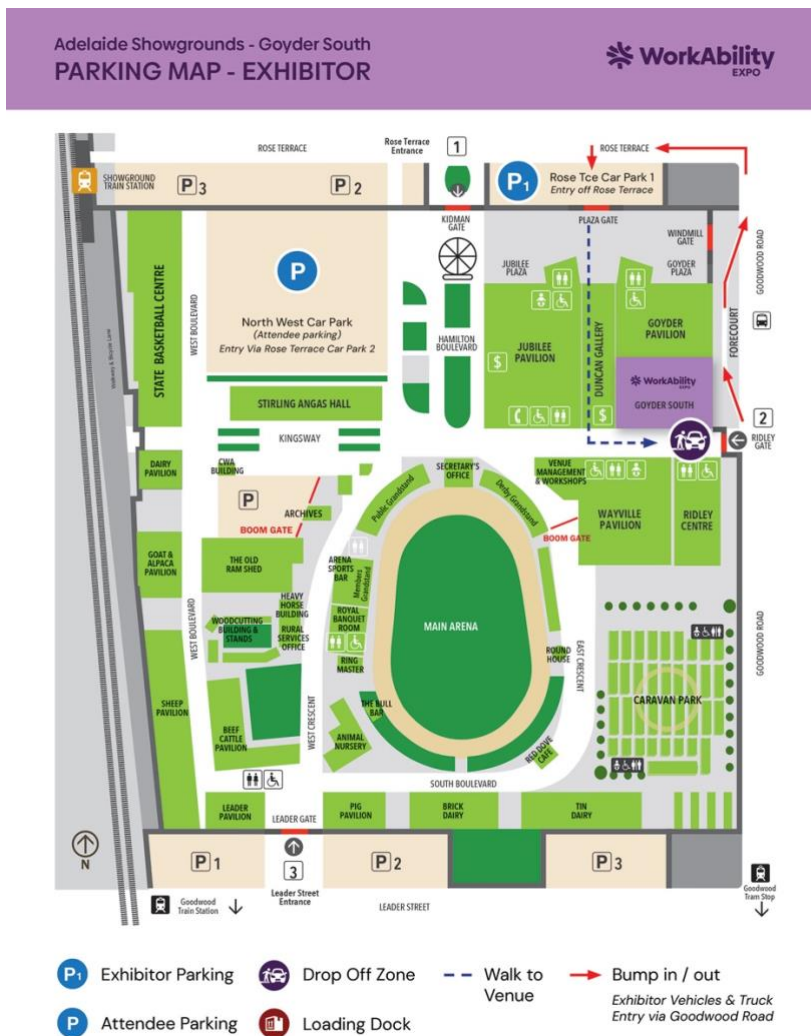
Figure 2: Exhibitor Parking Map

Otherwise exhibitors are advised to park in P1 during MIMO and the expo hours, entering from Rose Terrace. There is a designated one-way drop-off zone on Goodwood Rd, shown as below. Parking passes can be pre-booked via the Adelaide Showground Parking Portal by exhibitors.